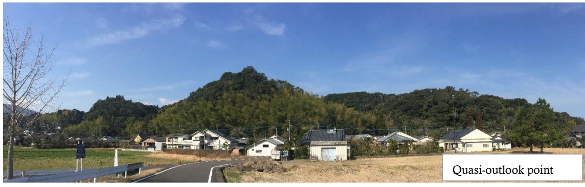
[ 31^{\circ} 21' 30'' N3628, 130^{\circ} 32' 17'' E3152, elevation of 7.9m]

We will install a "quasi-outlook point" outside of the area in accordance with our approach to the two outlook spots. We aim for any structures here to be arranged so as not to obstruct the landscape and to preserve a view of the natural environment and the Kiire Castle ruins.