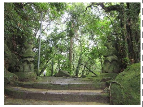
Statues of the Nio Guardians