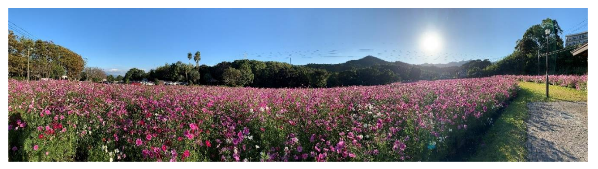
Viewpoint 2 [North latitude 31 degrees 30 minutes 37 seconds 6961, East longitude 130 degrees 29 minutes 54 seconds 2275, Altitude 59.89m]