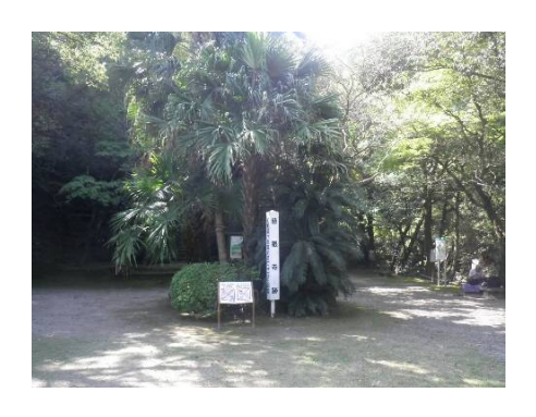
Jigenji Ruins (Designated Monument of Kagoshima City)