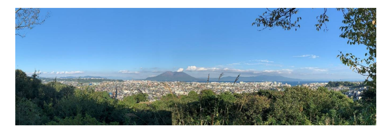
Viewpoint 1 [North latitude 31 degrees 30 minutes 42 seconds 8047, East longitude 130 degrees 30 minutes 04 seconds 6283, Altitude 76.67m].