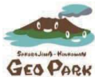
Figure 2. Logo of Sakurajima-Kinkowan Geo Park

As major schemes of the Third Kagoshima City Tourism Future Strategy (formulated in March, 2017) indicate, the city has been working on the expansion of tourism and enhancement of regional development through a multifaceted perspective, utilizing the Sakurajima volcano and Sakurajima-related materials such as “Sakurajima-Kinkowan Geo Park,” “Marine Activities in Kinkowan,” “the In-city Hot Springs,” “the Capital of the Delicious Food Made-in-Kagoshima,” and “Green Tourism.”