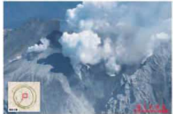
Figure 2. Volcanic Activities of Mt. Ontake

In recent years, the 2014 Ontake eruption claimed many lives, and Level 5 eruption warning was issued for the first time in the Kuchinoerabu Island in 2015, which eventually forced evacuation of the island's entire population. The year 2015 also saw Level 4 eruption warning in Sakurajima, as well as Level 3 in the Hakone volcano. Some volcanoes including Mt. Kirishima and Mt. Kusatsu-Shirane have been active since 2016, grabbing public attention.